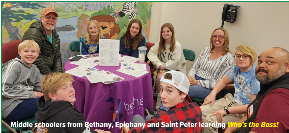
Middle schoolers from Bethany, Epiphany and Saint Peter learning Who's the Boss!

https://www.workingpreacher.org/commentaries/revise-common-lectionary/fourth-sunday-after-epiphany-2/commentary-on-mark-121-28-2